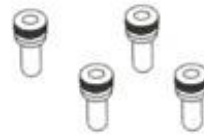
Screw for handlebar attachment x 4