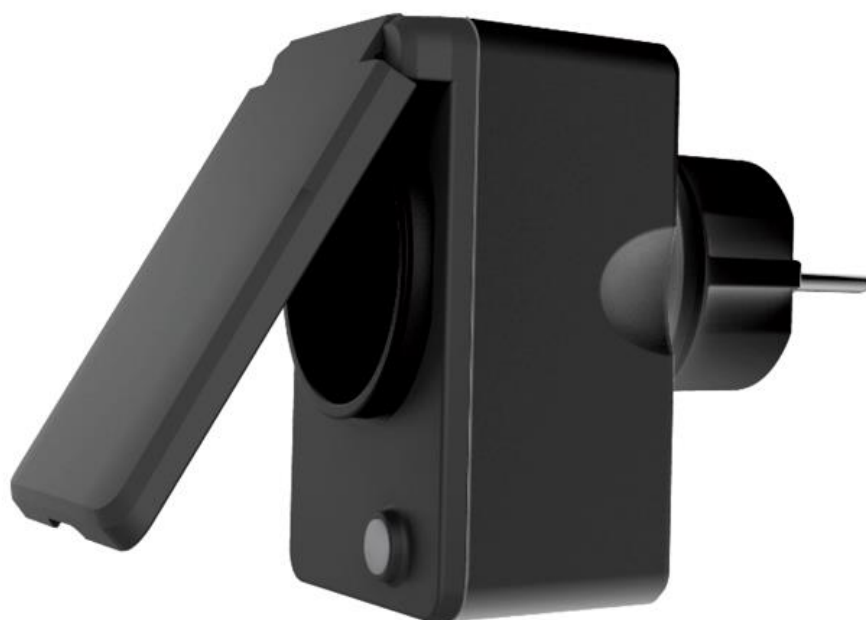
DENVER PLO-109 outdoor power plug