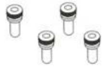
Screw for handlebar attachment x 4